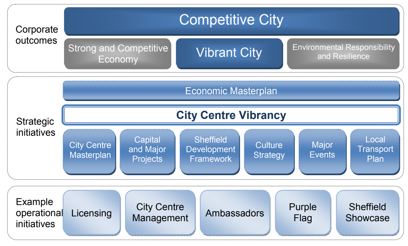
Figure 1 – Strategic Framework – Competitive City and City Centre Vibrancy